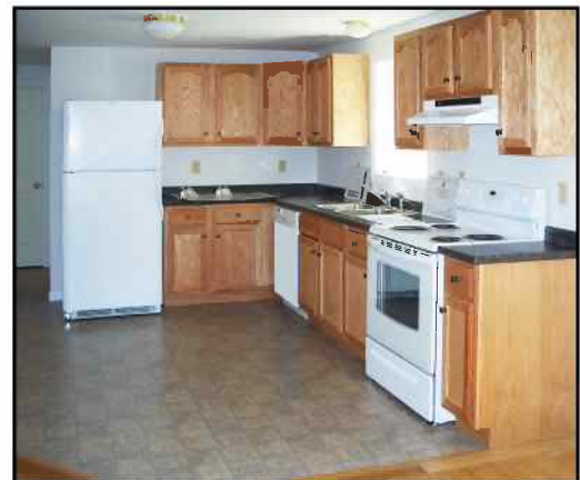
Large bright kitchen

516 Cottage St., Athol (near Route 2) $129,900 *