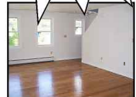
Light-filled main living area